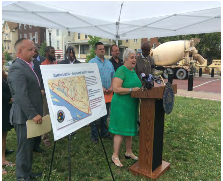
Steelton Borough, Dauphin County, and Steel-High School District Officials join the business community to announce the LERTA/EDRP Program.