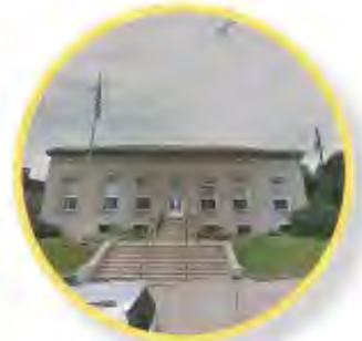
United States Postal Service

Paying from taxes is not equitable, because property value does not impact runoff. Tax exempt properties pay no taxes but make up a significant amount of the Impervious Area.