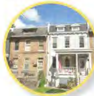
Single Family Residences

If a tax is used to pay for stormwater costs, the single family homeowner on the left would have to pay for stormwater, but the tax-exempt post office on the right would not pay anything, even though the property generates significantly more runoff.