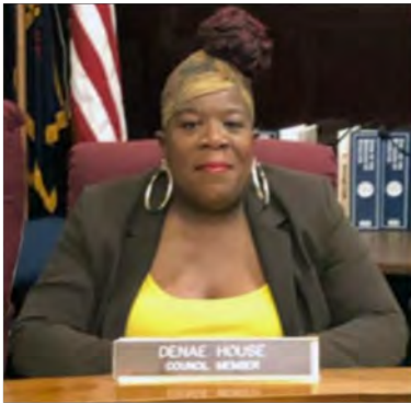
Denaë House, Pro Tem